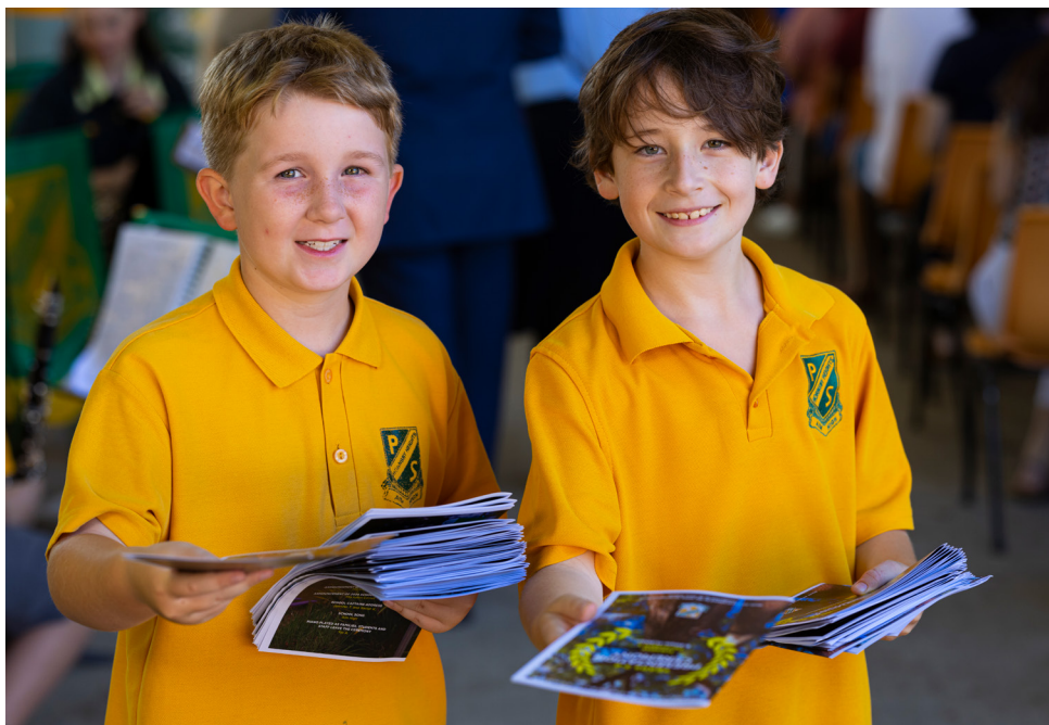
ABOVE: Our wonderful ushers for the Presentation Day Stage 2 and 3 event.

https://hornsbyhts-p.schools.nsw.gov.au/school-calendar.html