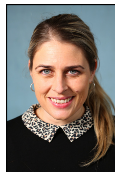
By KATRIN CORNELL Hornsby Heights Public School PRINCIPAL

Just a reminder that with our school uniform, the expectations for all students is to wear black leather school shoes. Sport shoes are only to be worn with sports uniform. I know many of you will be going shopping in the holidays to purchase shoes that students have grown out of! It is ok to have any colour sneakers, but school shoes need to be black. I thank you for your support.