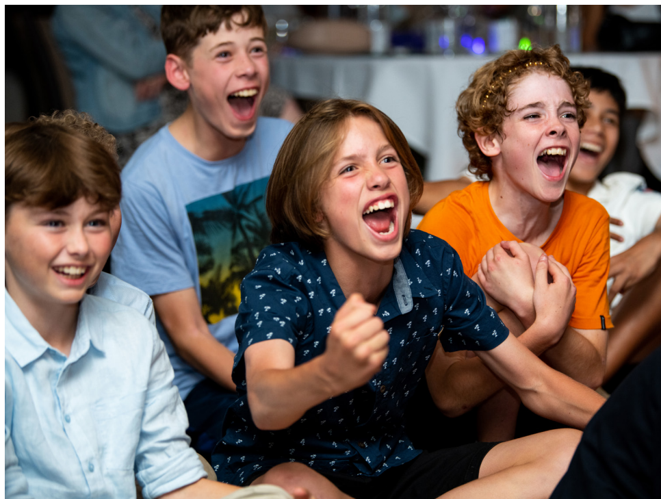
ABOVE: The Hornsby RSL was a marvellous venue for our Year 6 Farewell.

Dec 20 and 23: Christmas Wrapping Fundraiser at Westfield